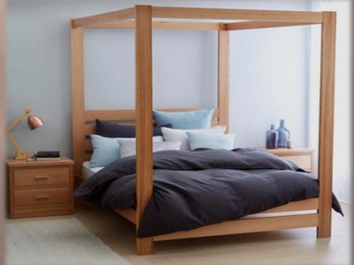
Springwood 4 poster bed available in Single, King Single, Double, Queen and King Size. Colour Natural decor