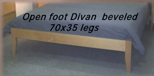
Open foot Divan beveled 70x35 legs