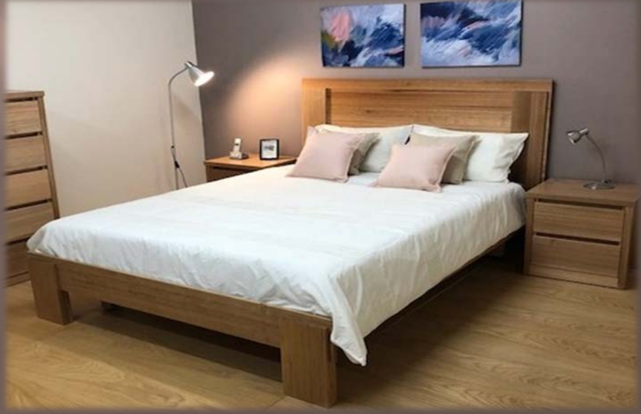
Coogee 4 piece bedroom suite with Chatswood cabinets 32mm tops ...colour Natural decor

Victorian Ash - Tasmanian Oak - Pale to light brown in colour with a pinkish tinge.