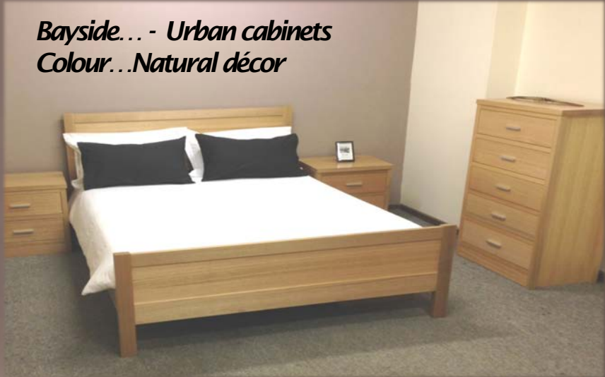
Bayside... - Urban cabinets Colour...Natural décor