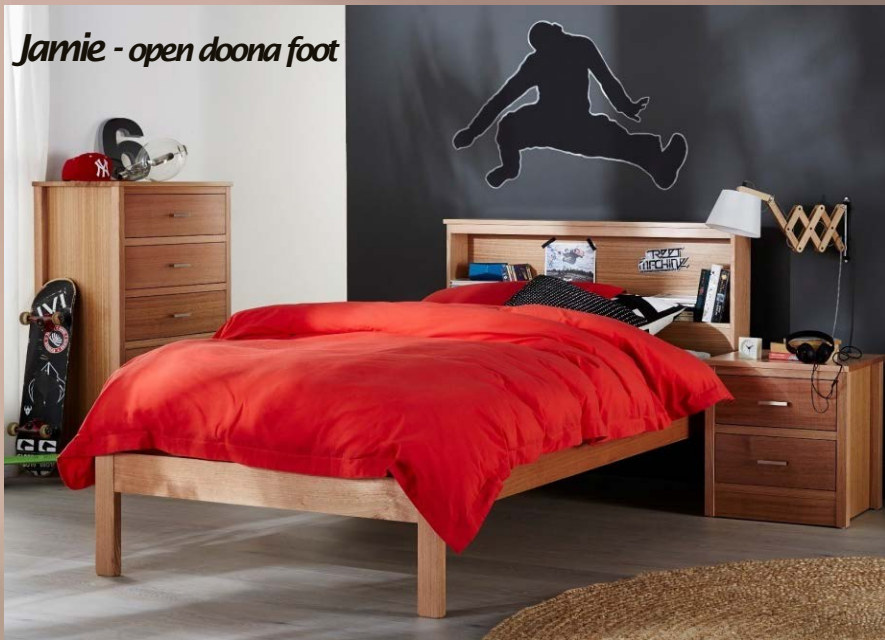
Jamie - open doona foot