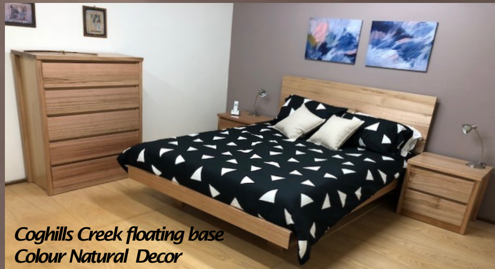
Coghills Creek floating base Colour Natural Decor

Victorian Ash - Tasmanian Oak - Pale to light brown in colour with a pinkish tinge.