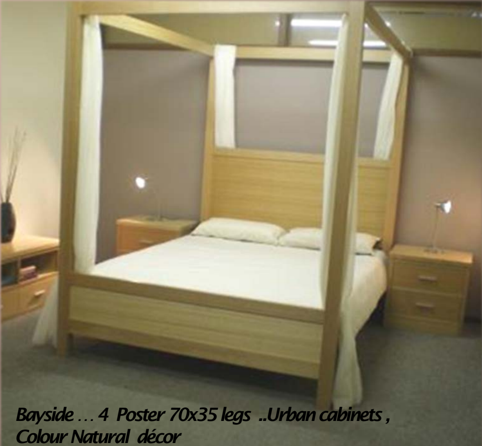
Bayside ... 4 Poster 70x35 legs ..Urban cabinets , Colour Natural décor