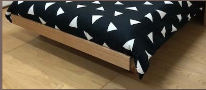
Addington ...available with floating base

Addington bedside tables 520mm or 585 mm wide Tall boy 935mm wide