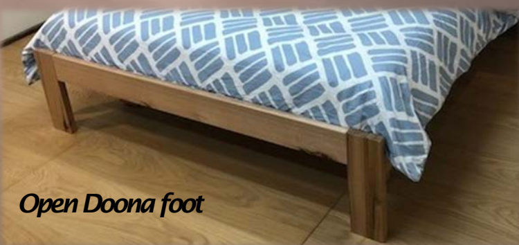
Open Doona foot