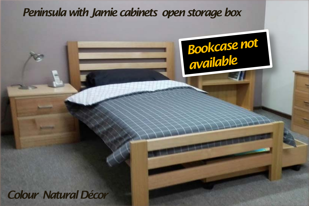
Peninsula with Jamie cabinets open storage box