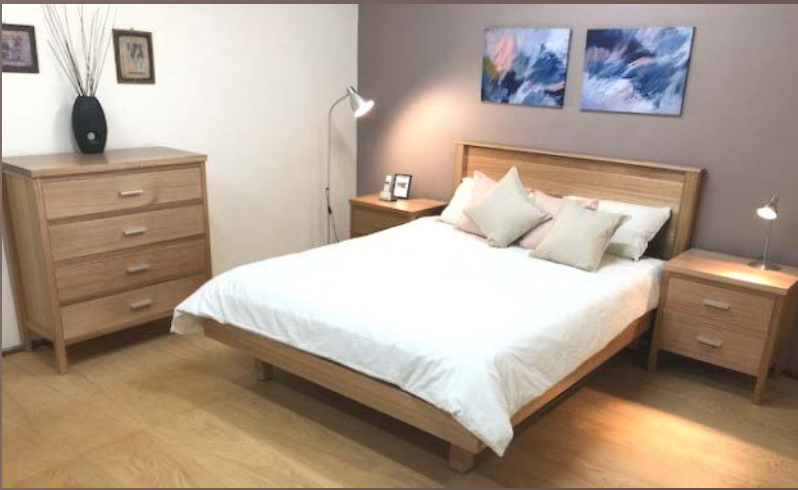
Bellevue Hill with floating base ...in Natural Décor on Ash