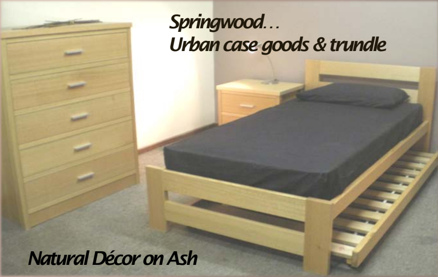
Natural Décor on Ash