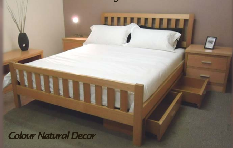
Colour Natural Decor