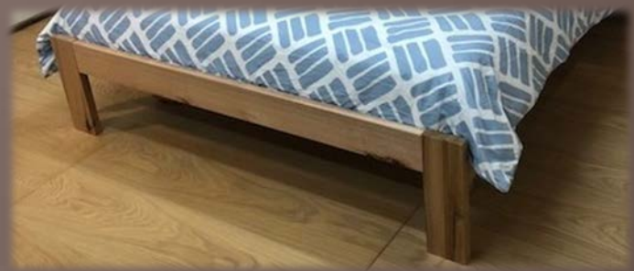
Addington ...available with open doona foot