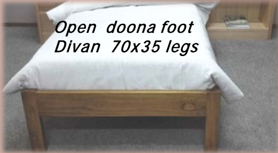
Open doona foot Divan 70x35 legs