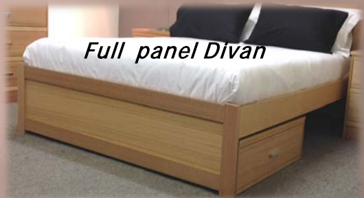
Full panel Divan