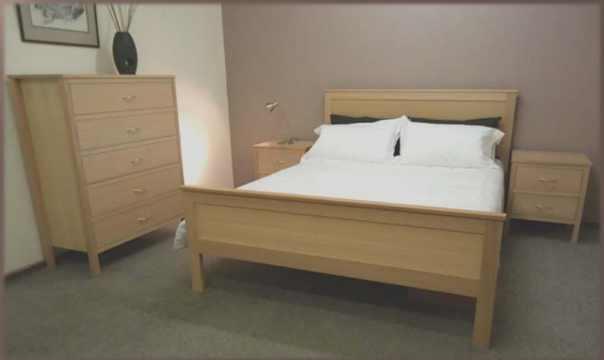
Sienna with Verona case goods Bow handles Colour decorator beige