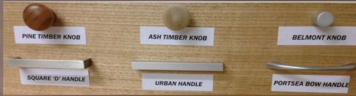
PINE TIMBER KNOB