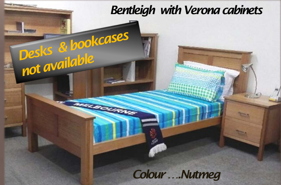
Bentleigh with Verona cabinets