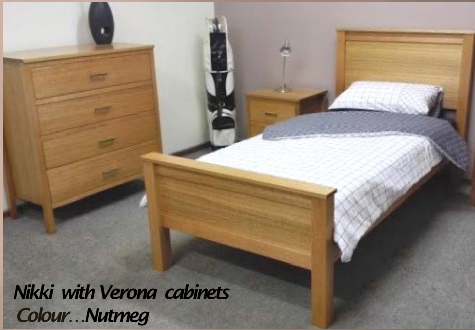
Nikki with Verona cabinets Colour...Nutmeg

Affordable bedroom furniture "Made in Australia"