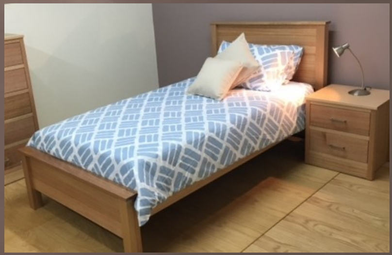
Bellvue Hill with 500 mm foot end ...colour ; Natural décor