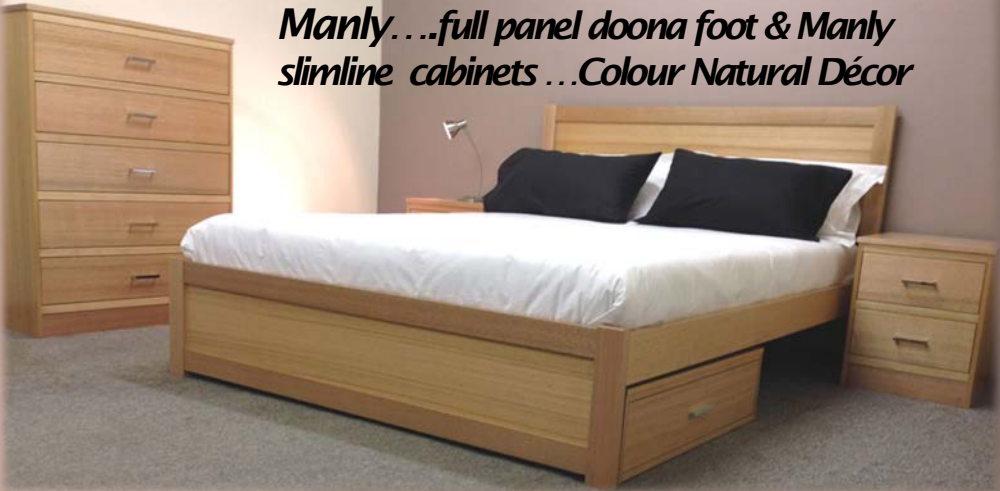
Manly...full panel doona foot & Manly slimline cabinets...Colour Natural Décor