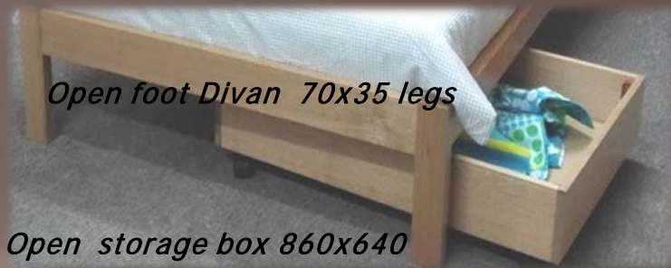
Open foot Divan 70x35 legs