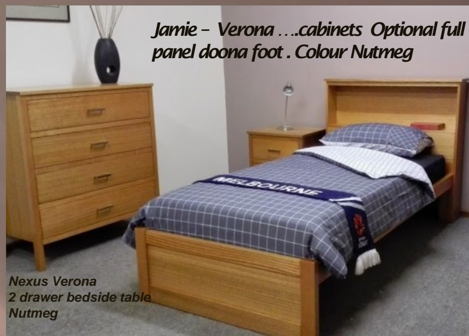
Nexus Verona 2 drawer bedside table Nutmeg