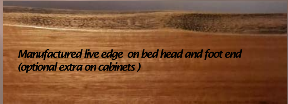
Manufactured live edge on bed head and foot end (optional extra on cabinets)