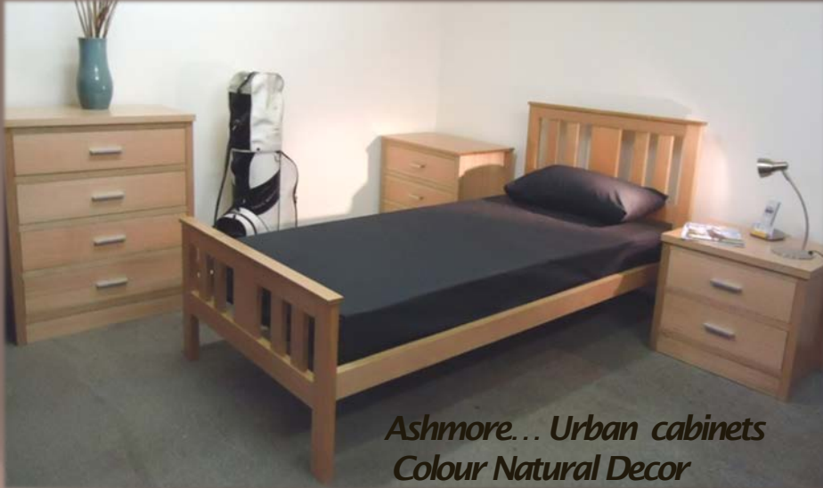
Ashmore... Urban cabinets Colour Natural Decor