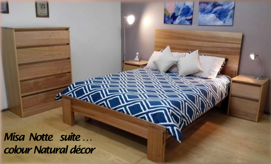
Misa Notte suite... colour Natural décor

Affordable bedroom furniture "Made in Australia"