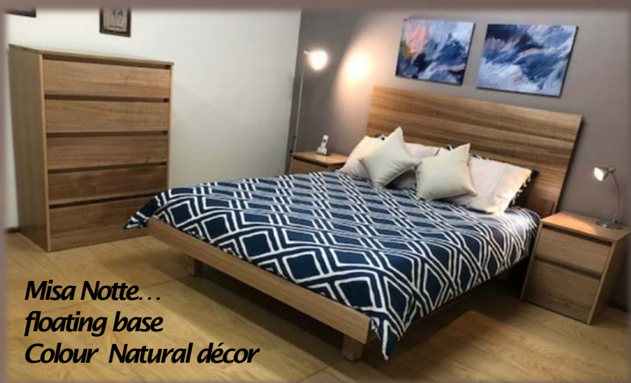
Misa Notte... floating base Colour Natural décor