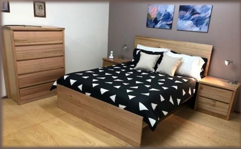
Fairview 19 mm square edge head and foot with Addington cabinets 32mm tops Colour Natural decor