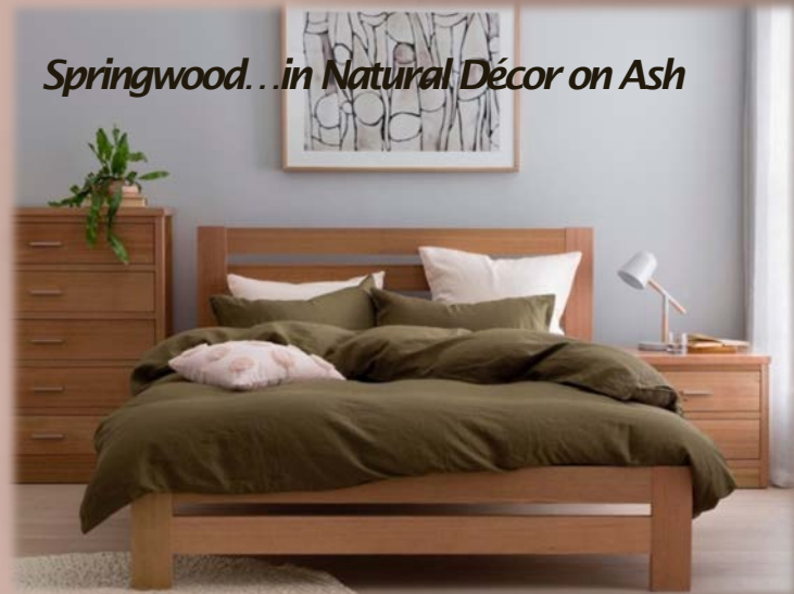
Springwood...in Natural Décor on Ash