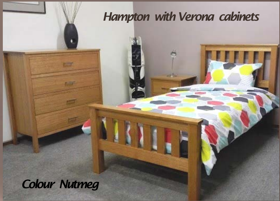
Hampton with Verona cabinets