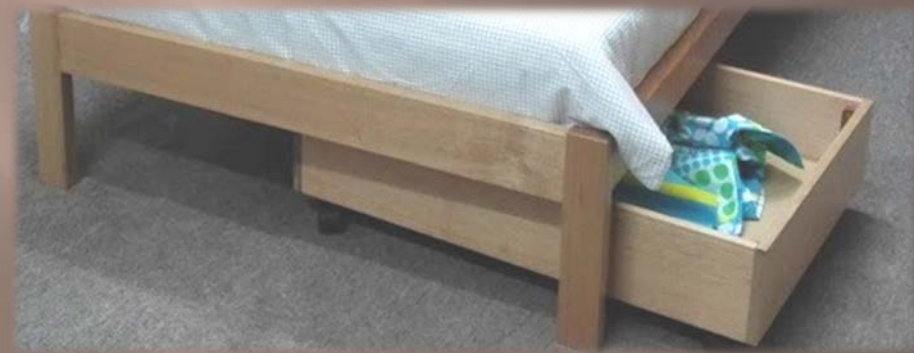
Open doona foot available with all beds or as a divan. Storage box 89cm x 68cm