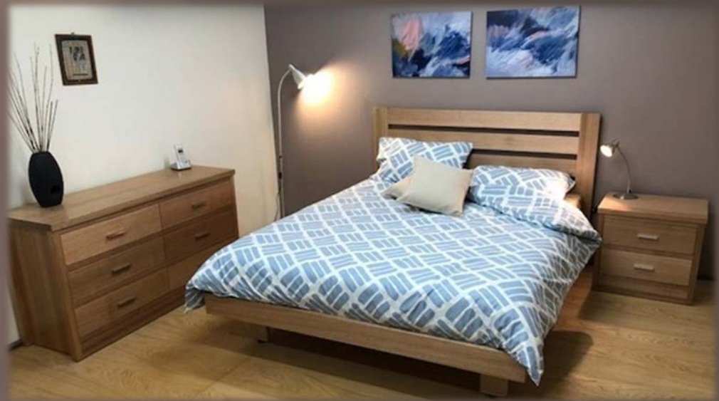
Springwood - Urban cabinets floating base ...Natural décor 7