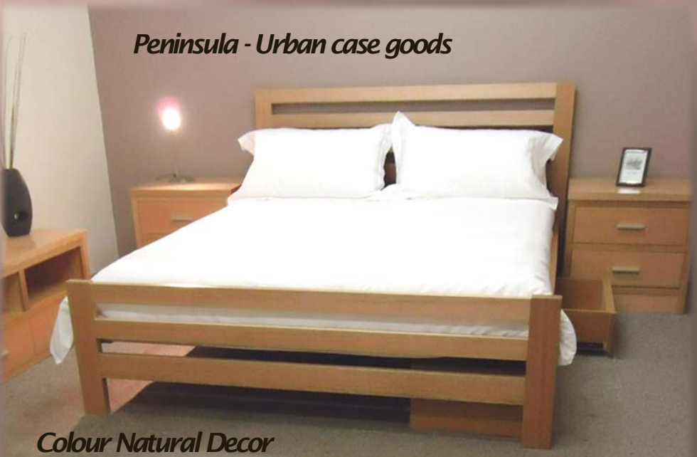
Colour Natural Decor

Victorian Ash - Tasmanian Oak Pale to light brown in colour with a pinkish tinge.